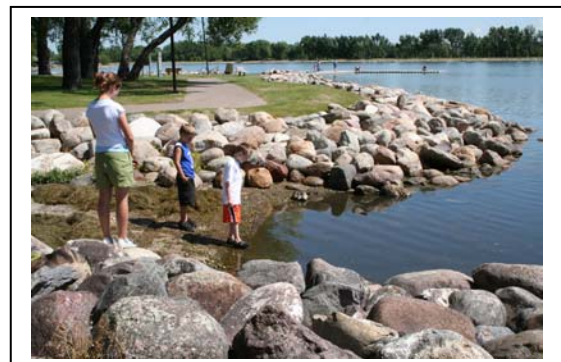
Green Parks and River Valley