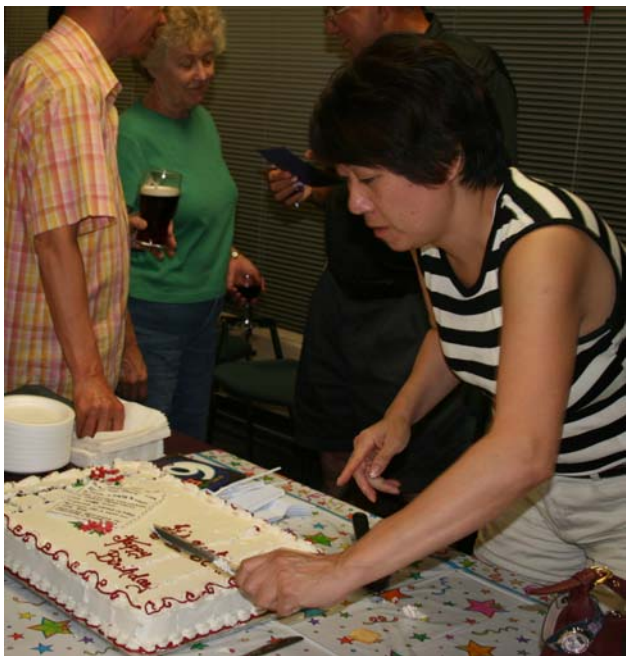
Can a Cougar cut cake... a 60's cake??!!