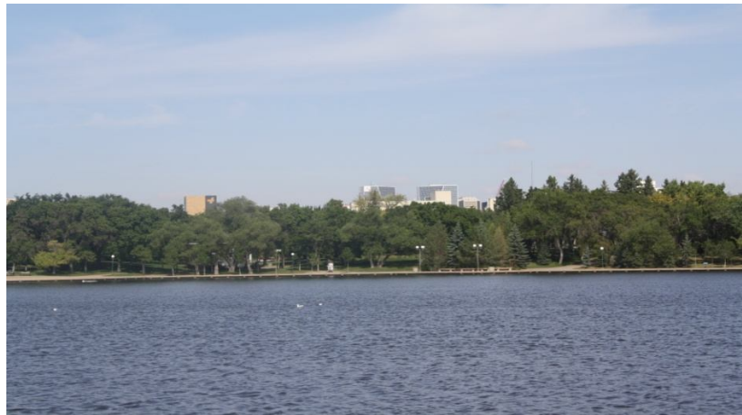
A view of Wascana Lake from the Legislature Building.

Thank-you to the Regional Committee members for their work so far.