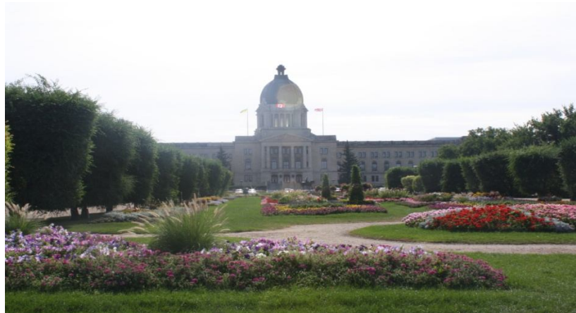
Legislature building- about a 4km walk from the hotel.

Barry is also hosting a panel show on Friday night at 6:30 in the main ball room.